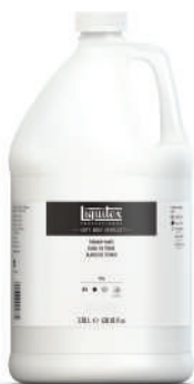
128oz (3.78l) - two colors (Mars Black, Titanium White)